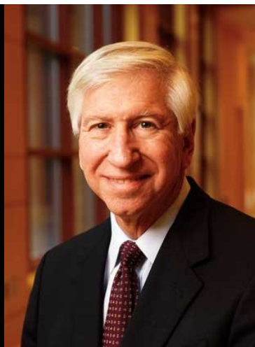
Dr. Myles N. Brand NCAA President September 16, 2009

Dr. Myles N. Brand, visionary leader, educator and reformer, who was serving as President of the National Collegiate Athletic Association (NCAA) has died after a heroic battle with pancreatic cancer. He was 67.