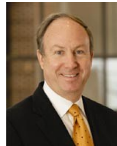
Paul Tribble, Chair Christopher Newport University

Paul Tribble Christopher Newport University