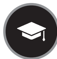
NCAA Graduation Rates Reporting System