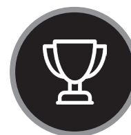
NCAA Sports Sponsorship Form