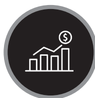
NCAA Financial Reporting System