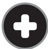
Annual Health and Safety Survey