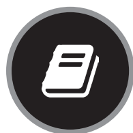
Academic Portal and Academic Performance Program

All of the data contained in IPP is currently collected by the NCAA. It includes information from: