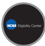
NCAA Eligibility Center