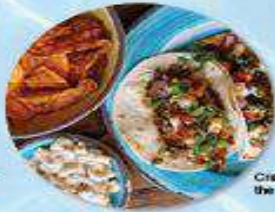
Crafted: Art of the Taco