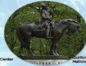
Guilford Courthouse National Military Park