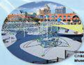
Greensboro Children's Museum