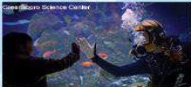
Greensboro Science Center

Family Atmosphere offering Laser Tag, Bowling, Arcade, and more. 5502 Hornaday Rd. 336-292-5100 sparetimeentertainment.com