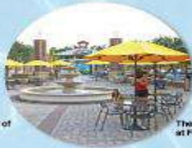
The Shops at Friendly Center

Four Seasons has something for everyone. 410 Four Seasons Town Centre, I-40 at W. Gate City Blvd. at exit 217. 336-292-0171. shopfourseasons.com