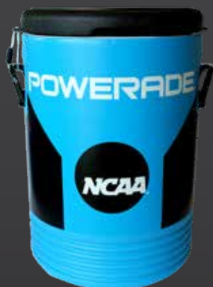
10gal Coolers 1/pack