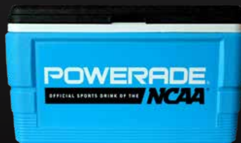
48Qt Ice Chest 1/pack