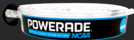
Cups Holders 1/pack