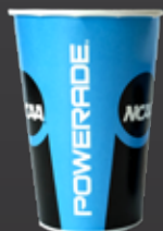
16oz cups 1000/pack