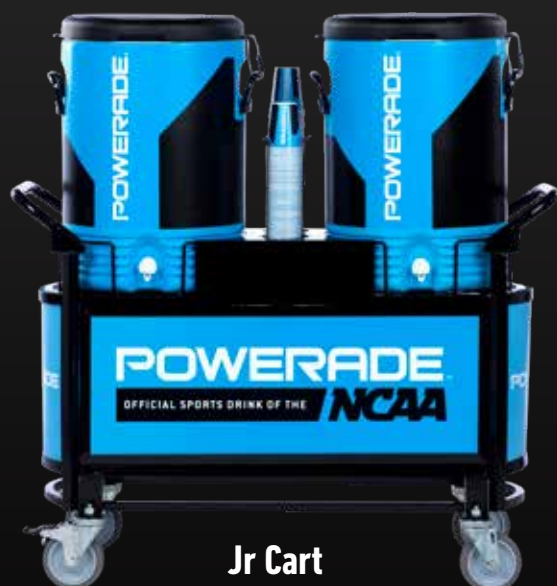
Jr Cart 1/pack