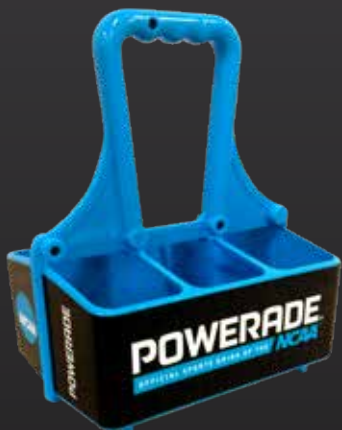
Bottle Carriers 4/pack