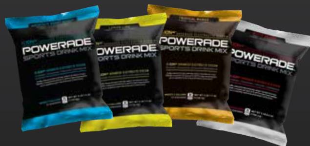
5 Gallon Powder 12/pack Mountain Berry Blast®, Lemon Lime, Tropical Mango, & White Cherry