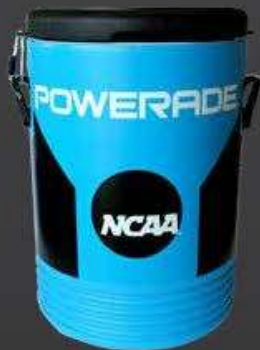
10gal Coolers 1/pack