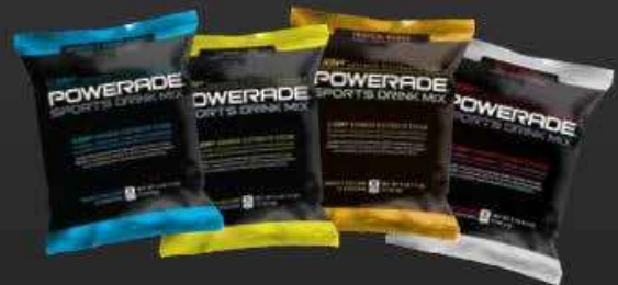
5 Gallon Powder 12/pack Mountain Berry Blast®, Lemon Lime, Tropical Mango, & White Cherry