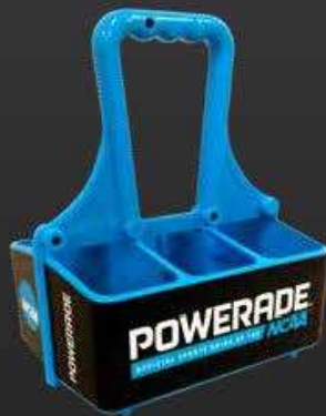
Bottle Carriers 4/pack