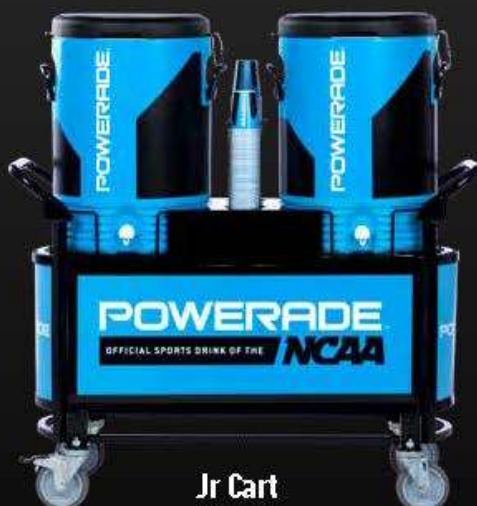
Jr Cart 1/pack