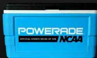
48Qt Ice Chest 1/pack