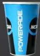
16oz cups 1000/pack