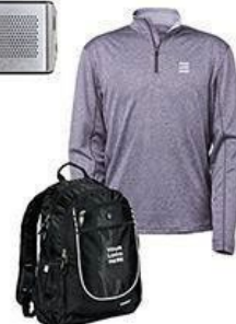
Jacket + Backpack Bundle

Your institution may select different items per participant; men's and women's sizes are available for apparel items. If you would like to purchase additional awards, you will have the opportunity to do so online via personal credit card at the end of the checkout process.