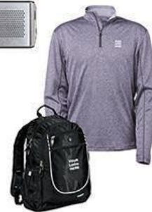
Jacket + Backpack Bundle

After the championship, MainGate will send the head coach an email providing ordering process details, along with a unique Certificate Code (valid for one participation award per member of your official travel party) that can be redeemed only at www.NCAA-Awards.com . In order to ensure that each participant receives his or her award, a member of your administration must place your team's order, including size information, at NCAA-Awards.com using your Certificate Code.