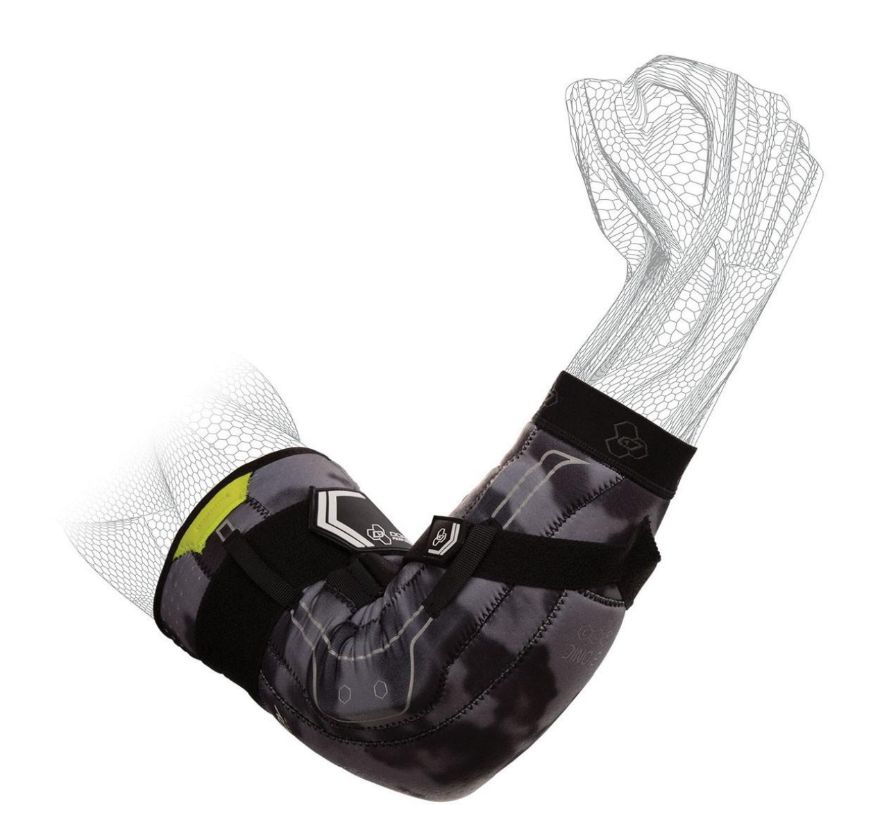
Currently there is nothing in the rule book that prohibits the use of an arm sleeve or brace.

c. After some weather concerns by teams, we are now down to two teams in the meet, leaving us with some small fields in several field events. Rule 4, Article 10 says that we can combine genders if we have fewer than five competitors per gender. Some of our horizontal field events meet that requirement (LJ, TJ, JT, HT). The Shot Put we have enough in each gender to warrant separating the event. In the discus we are wondering if it is possible to combine... We have 6 men and 3 women. We are running the meet on Wednesday this week. There are currently threats of thunderstorms throughout the day, and because of that we are wanting to try to be efficient wherever we can in the meet. Combining the discus event would allow us to avoid an extra 30 mins or so of warmup time for the event. Also, it would keep our total numbers at 9,